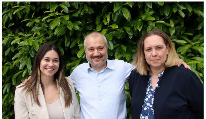
The ELA Team

New President and Vice President for ELA!